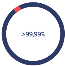
Accuracy since 2010

What Sets Us Above (Not Just Apart) From The Rest